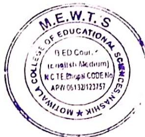
Principal Motiwala College of Educational Sciences, Nashik